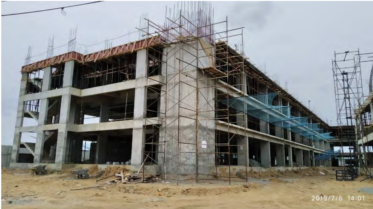
Second Floor Roof Slab – Slab Reinforcement Work in Progress