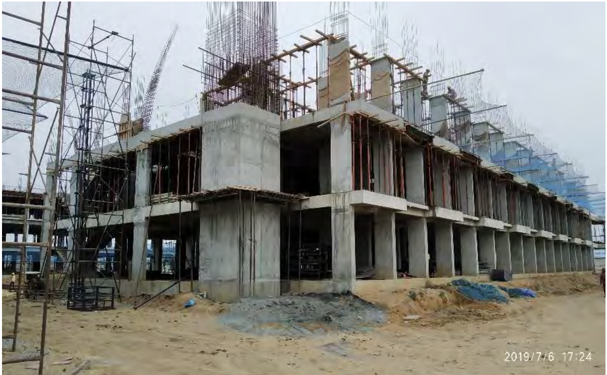
Second Floor Roof Slab – Column casting and Slab Shuttering Work In progress