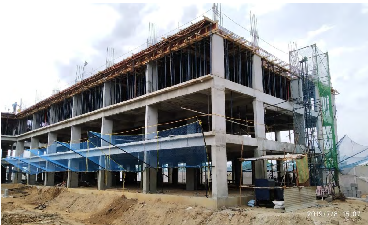
Second Floor Roof Slab – Slab Reinforcement Work in Progress