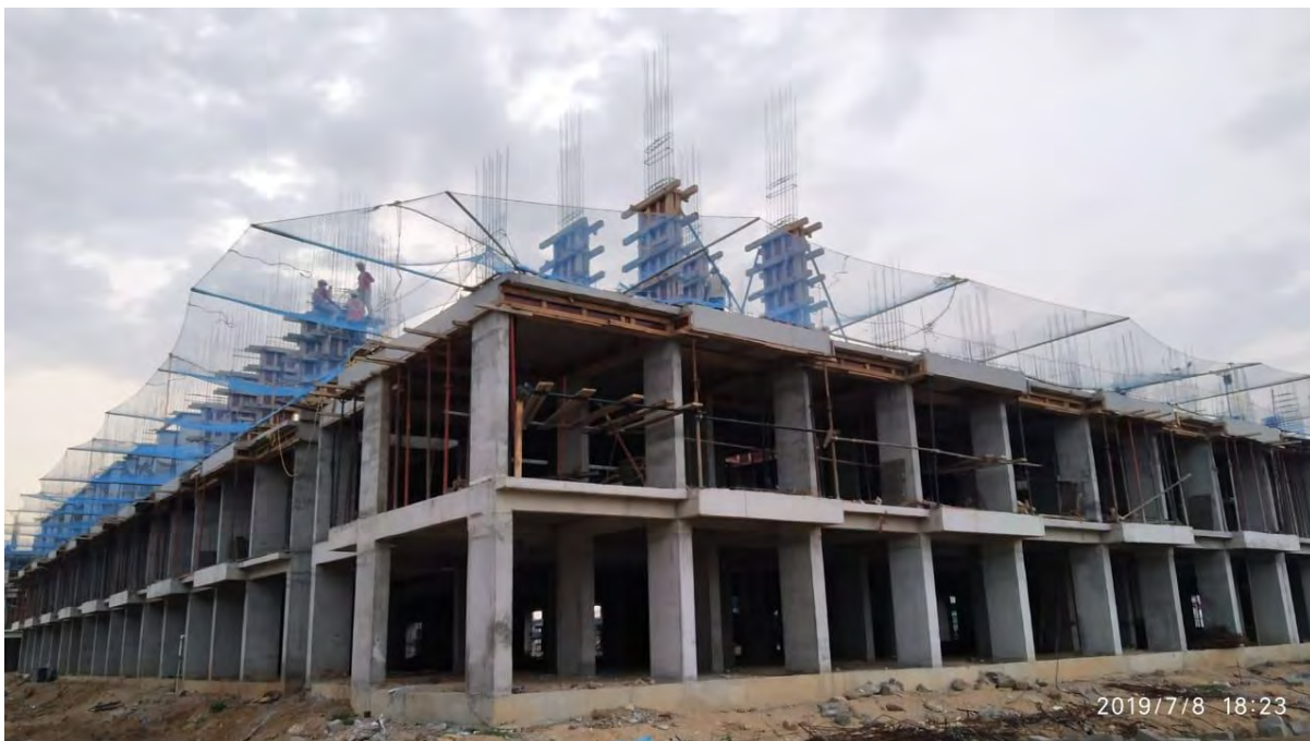
Second Floor Roof Slab – Column casting and Slab Shuttering Work In progress