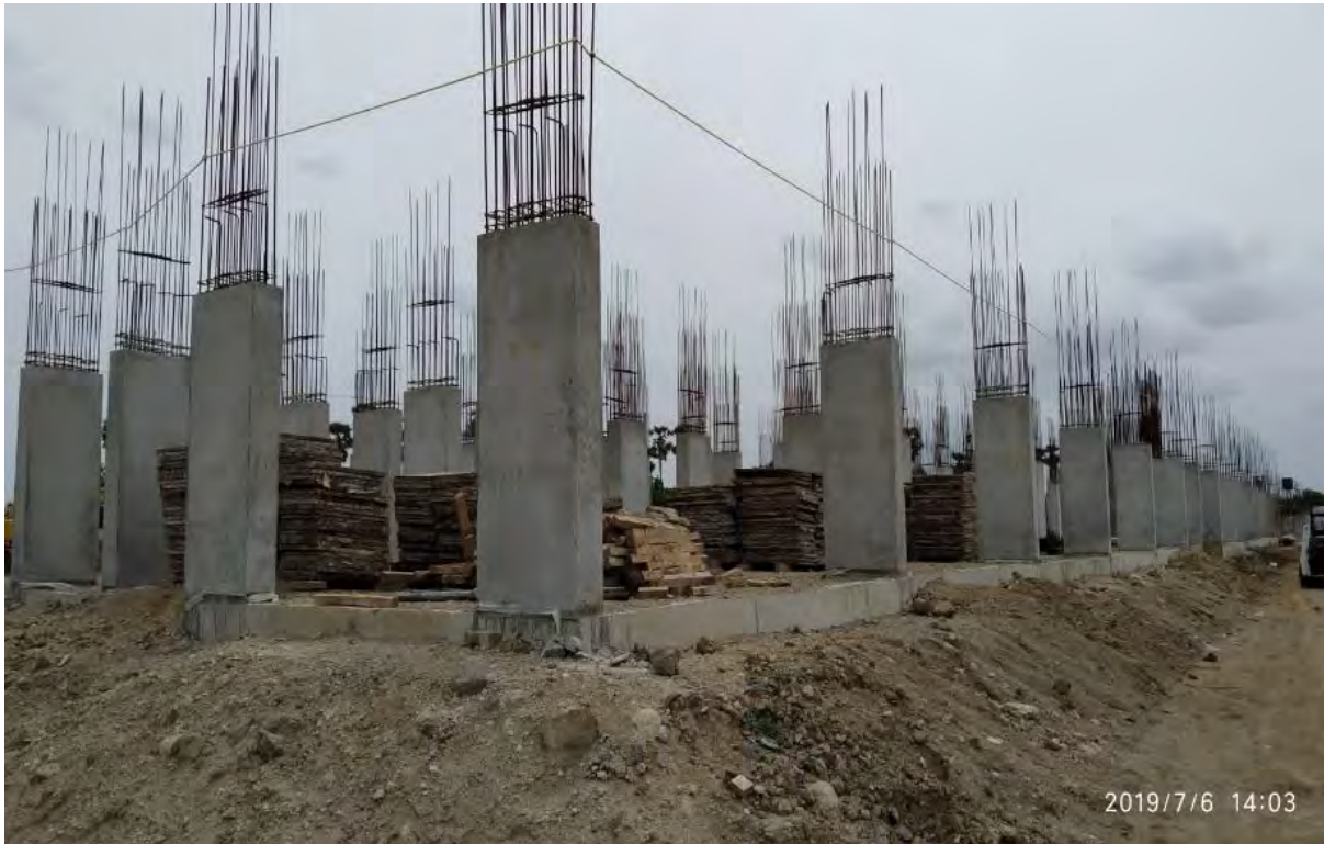
Foundation and Stilt Floor Roof Slab – Column Casting Work in Progress