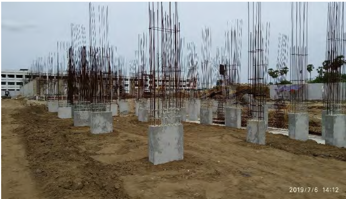
Foundation – Back Filling Work in Progress