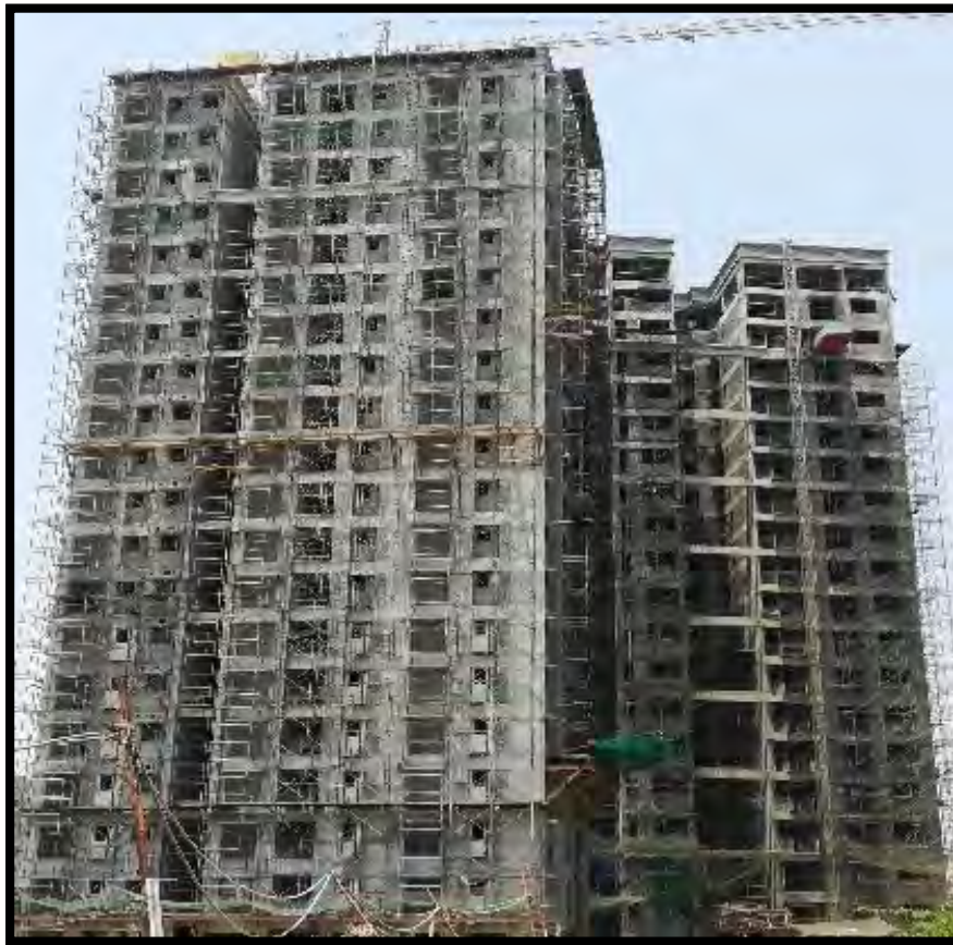
BLOCK 1 & 2